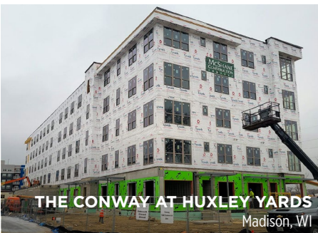
THE CONWAY AT HUXLEY YARDS Madison, WI

This affordable housing community provides units in one- to three-bedroom floorplans with high-end finishes.