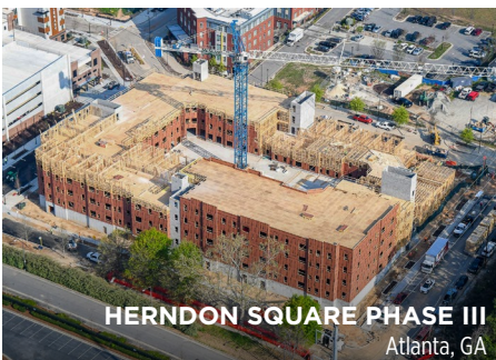
HERNDON SQUARE PHASE III Atlanta, GA

Construction is nearing completion at District Eastside, a 262-unit multi-family development that includes ten live/work units.