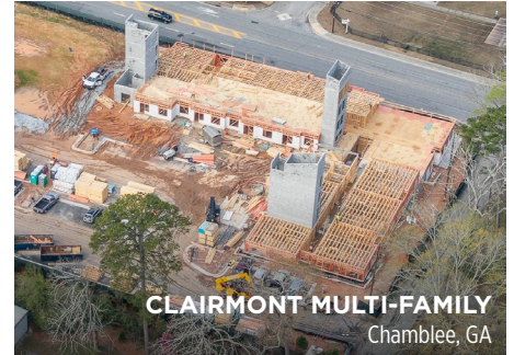
CLAIRMONT MULTI-FAMILY Chamblee, GA

Positioned on a 4.6-acre site, this 248-unit residential development offers upscale apartment finishes and an extensive amenity package.