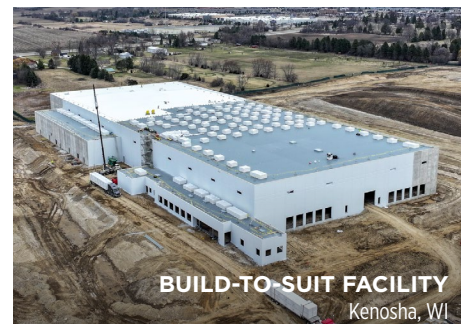
BUILD-TO-SUIT FACILITY Kenosha, WI

Designed with sustainability in mind, this 76-unit affordable housing development features a rooftop solar array and an innovative "blue roof" system.