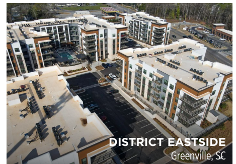
DISTRICT EASTSIDE Greenville, SC

This 315-unit apartment community integrates six garden-style buildings with a first-class amenity package.