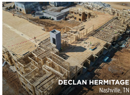
DECLAN HERITAGE Nashville, TN

Construction continues at this five-story podium-style building offering four stories of apartments atop an above-grade precast parking garage.