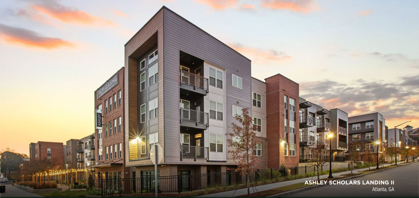
ASHLEY SCHOLARS LANDING II Atlanta, GA