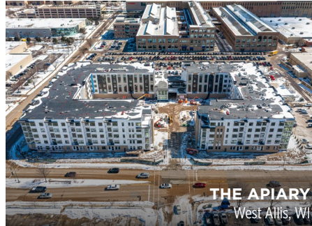
THE APIARY West Allis, WI

This luxury apartment complex offers 320 units across four buildings and over 10,000 square feet of amenity space.