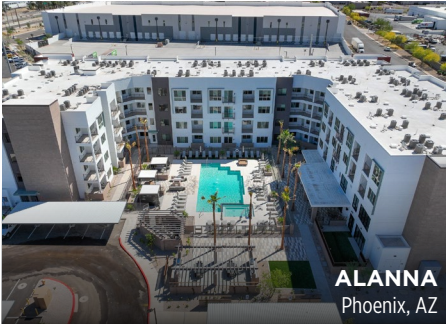
ALANNA Phoenix, AZ

This luxury apartment complex offers 320 units across four buildings and over 10,000 square feet of amenity space.