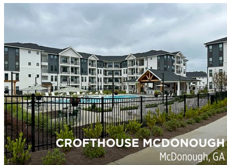
CROFTHOUSE MCDONOUGH McDonough, GA

Construction continues at this 316-unit luxury apartment residence near Phoenix that will boast high-end finishes and features.