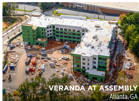
VERANDA AT ASSEMBLY Atlanta, GA

Located near Chicago, this 713,000-square-foot development offers 373 luxury apartments, a parking garage, and generous amenities.