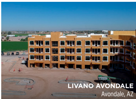
LIVANO AVONDALE Avondale, AZ

This 300-unit community featuring three garden-style apartment buildings and a central clubhouse is nearing completion in Charlotte.