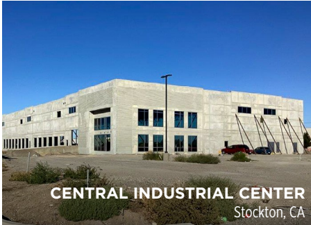
CENTRAL INDUSTRIAL CENTER Stockton, CA

This three-building speculative development will offer nearly 1.1 million square feet of Class A industrial space in Stockton.