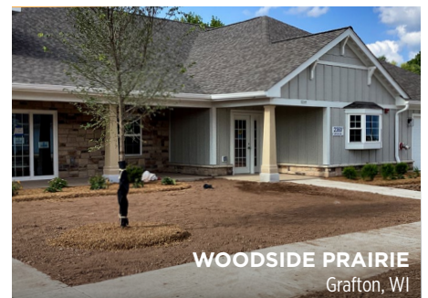
WOODSIDE PRAIRIE Grafton, WI

This affordable senior living residence will provide 100 units in a four-story building with nearly 3,000 square feet of amenities.