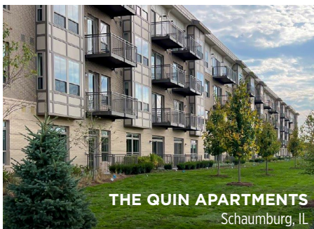
THE QUIN APARTMENTS Schaumburg, IL

This three-building garden-style community will incorporate 310 units and 8,000 square feet of amenity space including an outdoor pool.