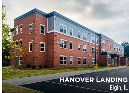
HANOVER LANDING Elgin, IL

This three-building speculative development will offer nearly 1.1 million square feet of Class A industrial space in Stockton.