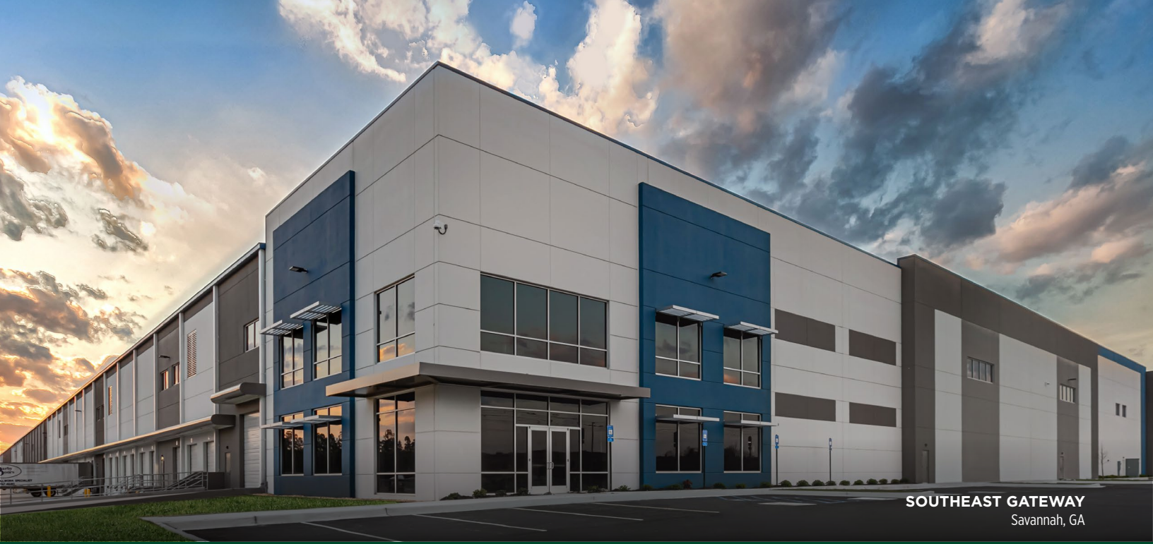
SOUTHEAST GATEWAY Savannah, GA