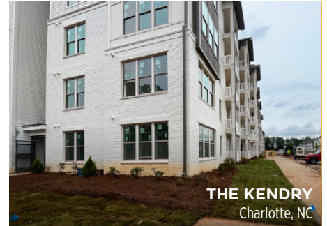
THE KENDRY Charlotte, NC

The recently completed Hanover Landing integrates 40 affordable apartments that serve vulnerable populations and individuals with disabilities.