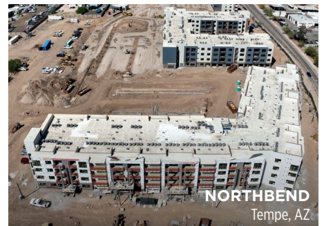
NORTHBEND Tempe, AZ

Construction is nearing completion at this six-building, 280-unit garden-style community that offers more than 15,000 square feet of amenity space.