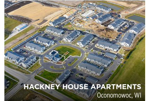
HACKNEY HOUSE APARTMENTS Oconomowoc, WI

This three-building speculative development will offer nearly 1.1 million square feet of Class A industrial space in Stockton.