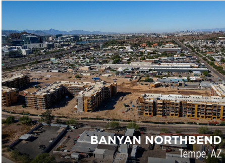
BANYAN NORTHBEND Tempe, AZ

This three-building garden-style community will offer 310 luxury apartment units with 8,000 square feet of amenity space.