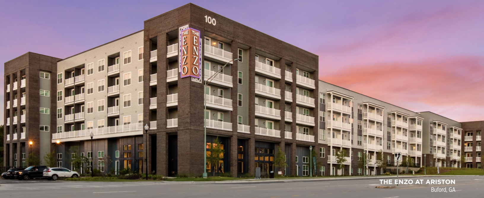
THE ENZO AT ARISTON Buford, GA