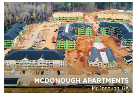
MCDONOUGH APARTMENTS McDonough, GA

This three-building multi-family development in Phoenix will include 242 units and generous amenities including an outdoor pool and tennis court.