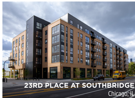
23RD PLACE AT SOUTHBRIDGE Chicago, IL

Construction continues on this luxury apartment residence that will feature 322 units and an impressive 28,000 square feet of amenity space.