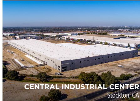
CENTRAL INDUSTRIAL CENTER Stockton, CA

This three-building garden-style community will offer 310 luxury apartment units with 8,000 square feet of amenity space.