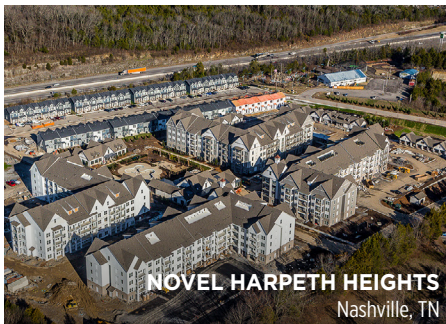
NOVEL HARPETH HEIGHTS Nashville, TN

Located southeast of Atlanta, this garden-style community will offer 280 apartment units across six buildings.