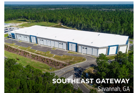
SOUTHEAST GATEWAY Savannah, GA

Recently completed on Chicago's Near South Side, this project features 206 mixed-income apartment units and 17,000 square feet of retail space.