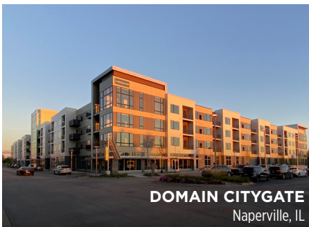
DOMAIN CITYGATE Naperville, IL

Construction is progressing at this 302-unit garden-style apartment complex west of Milwaukee in Oconomowoc, Wisconsin.