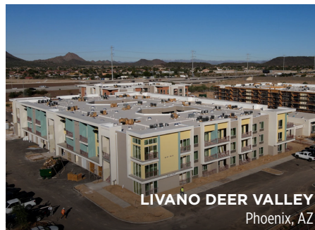
LIVANO DEER VALLEY Phoenix, AZ

This four-story mixed-use development will include 285 luxury apartment units and an event space on top of a precast concrete parking garage.