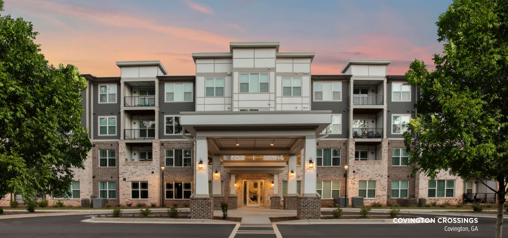
COVINGTON CROSSINGS Covington, GA