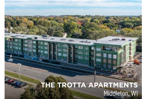
THE TROTTA APARTMENTS Middleton, WI

This 286-unit luxury multi-family development in Scottsdale will feature generous resort-style amenities and beautiful mountain views.