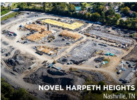
NOVEL HARPETH HEIGHTS Nashville, TN

This second phase of this industrial development features three buildings totaling 292,000 square feet with clear heights ranging from 24' to 32'.