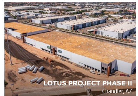
LOTUS PROJECT PHASE II Chandler, AZ

This 481,487-square-foot industrial facility is nearing completion in California. Building finishes are nearly final and tenant improvement work is underway.