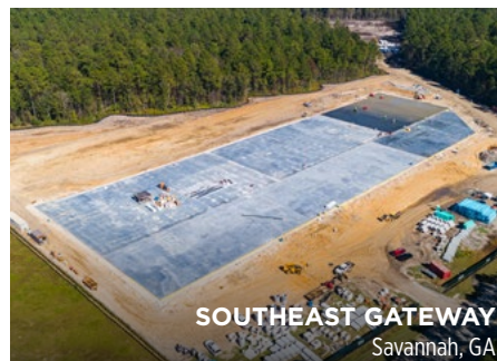
SOUTHEAST GATEWAY Savannah, GA

Construction is progressing on this luxury apartment residence. The project will feature 322 units and an impressive 28,000 square feet of amenity space.