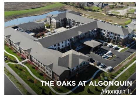
THE OAKS AT ALGONQUIN Algonquin, IL

Building pads are underway on this two-building, 1.2 million-square-foot speculative industrial development located near the Port of Savannah.