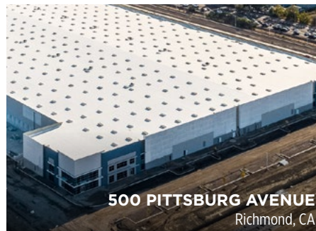
500 PITTSBURG AVENUE Richmond, CA

This four-story affordable senior living residence was recently completed for repeat client, Dominion. The project includes 238 units and best-in-class amenities.