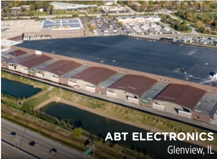
ABT ELECTRONICS Glenview, IL

The warehouse expansion to Abt Electronics' existing facility is in its final stages. This 420,000-square-foot addition will more than double the existing space.