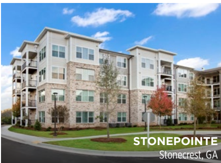
STONEPOINTE Stonecrest, GA

This four-story, 126-unit apartment residence features an underground parking garage, a fitness room, a dog wash and two rooftop decks.