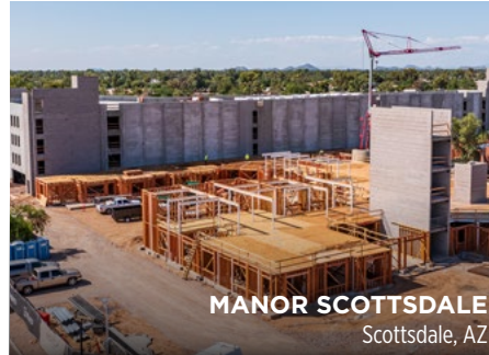
MANOR SCOTTSDALE Scottsdale, AZ

The warehouse expansion to Abt Electronics' existing facility is in its final stages. This 420,000-square-foot addition will more than double the existing space.