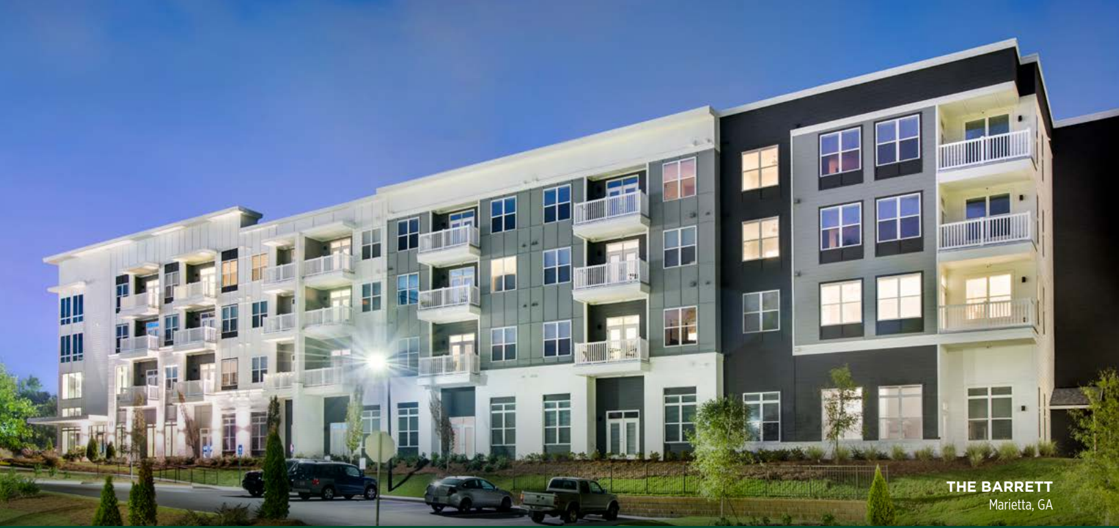
THE BARRETT Marietta, GA